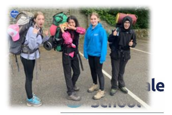
Chorus Education Trust