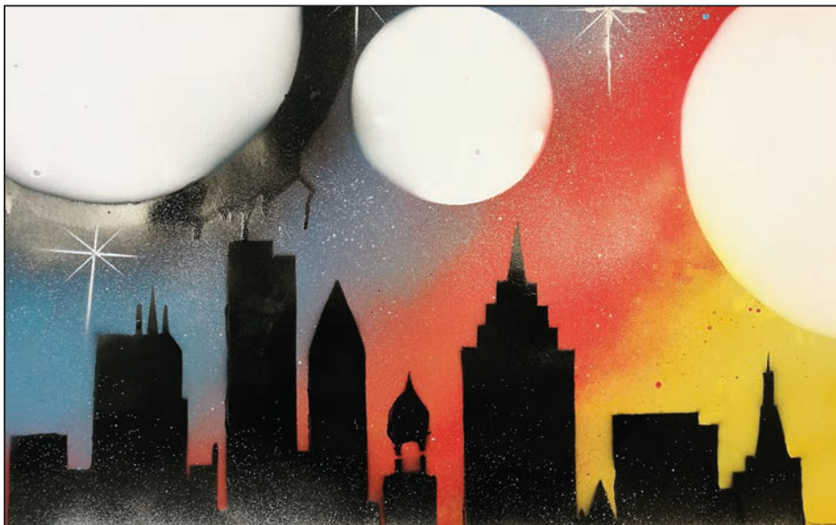
Artwork created by our A-level students who used spray painting techniques. The students were kitted out in protective jumpsuits and all given squad names!