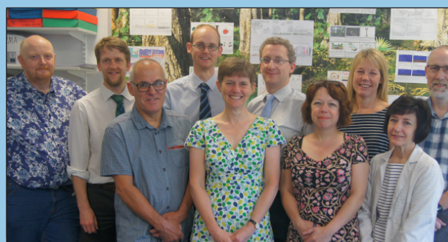
Meet the Science Department.

Teachers are specialists in their area of biology, physics or chemistry, which is in contrast to other schools where staff are expected to teach all